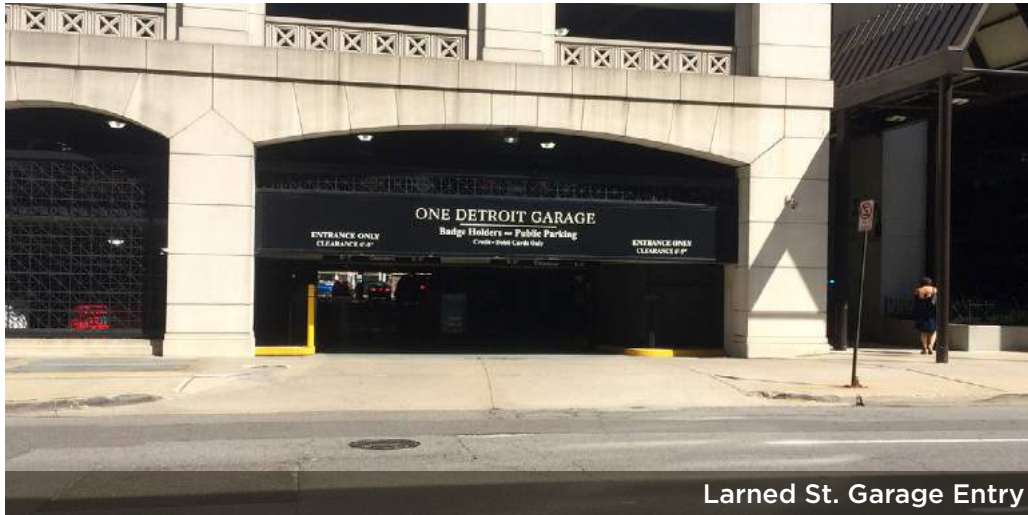
Larned St. Garage Entry